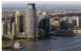
The Goldman Sachs Building in Jersey City, New Jersey.

f Recommend x Tweet 0 in Share More ▾ Email Print